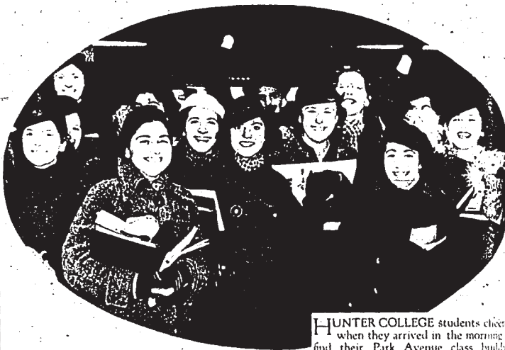
HUNTER COLLEGE students cheer when they arrived in the morning and find their Park Avenue class building burned to the ground.