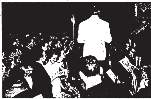
More than 2,000 University of Michigan students crowd around the bandstand to listen to Jimmie Lunceford and his music.