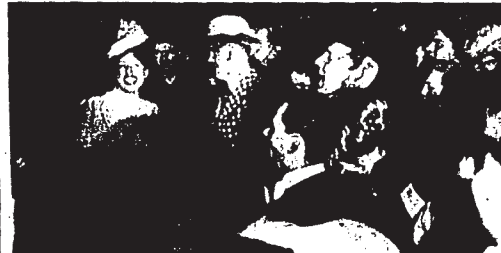
Washington University (St. Louis) students donned old-time costumes for the T-Square Tussle.