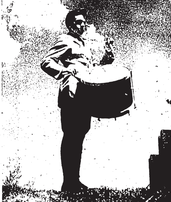
ONE OF THE DRUMMERS in Cornell's 12-piece R. O. T. C. band, whose playing is one of the features of football games on the Big Red's Scholes Field, posed for this artistic photograph.